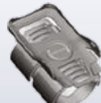
• Wearable Holder